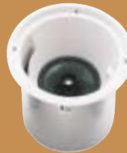
EVID C8.2HC THE EXCLUSIVE "PATTERN CONTROL" SOLUTION