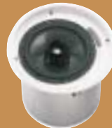
EVID C8.2 THE FULL RANGE POWERHOUSE